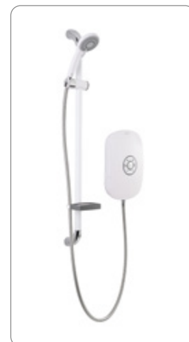
Standard Kit with white riser rail