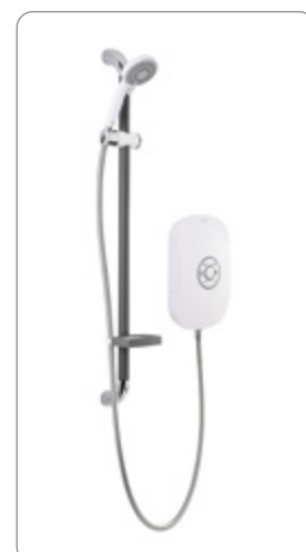
Optional riser rail: Mid Grey