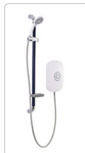
Optional riser rail: Dark Blue